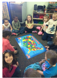
New Floor Puzzle!