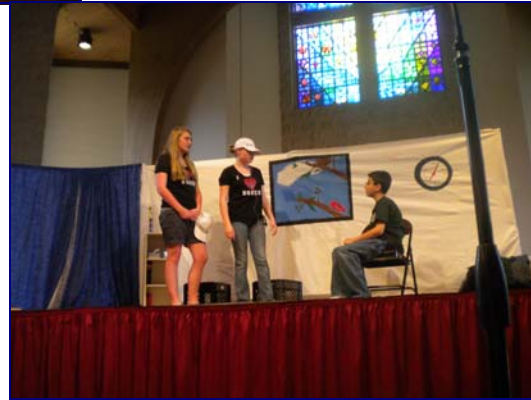
Middle School Play