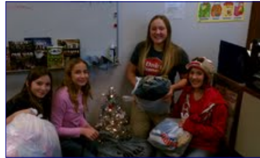
Service Projects Operation Christmas Child, Clothing Drive