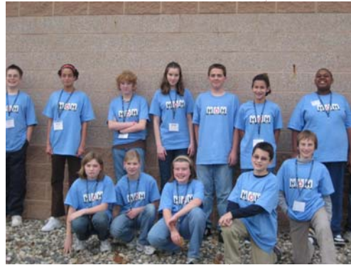
West Michigan Lutheran Schools Science day