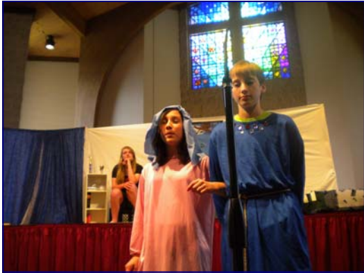
Middle School Play