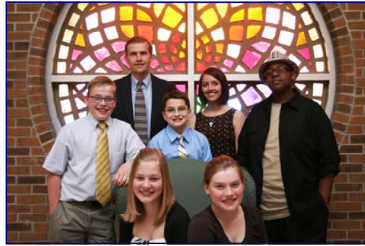
8th Grade Graduation