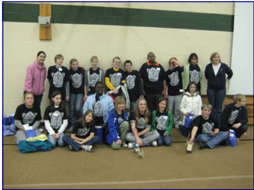
West Michigan Lutheran Schools Science Day